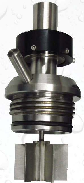
SGSM Cell Cap Assembly